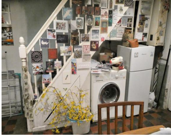
Illustration 3: 'We all have interesting backgrounds'

One of the advantages of on-line 'Ringing Room', is that you can pop in for 20 mins or so, and then step out, without too much bother.