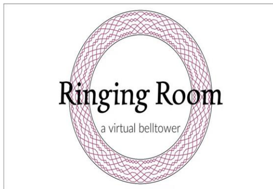
Illustration 1: The title Page - "all who adare enter"

"Huddled in their homes, isolated, due to the vast plague that covers the land. A historic few wandered out on to the internet hills to hold the Oxford City Branchs' very first on-line ringing practice."