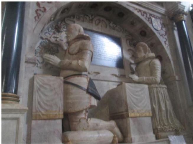
Photos of All Saints Church, Wing, Bucks