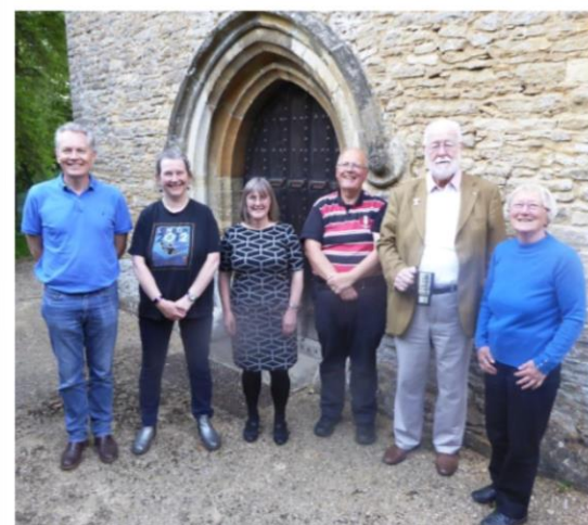
Photo from 2018 at Bletchington shows him 2nd on the right.