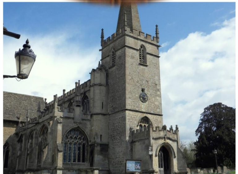
Photos of Lacock Bakery (upper left) & church/ringing tower (above)